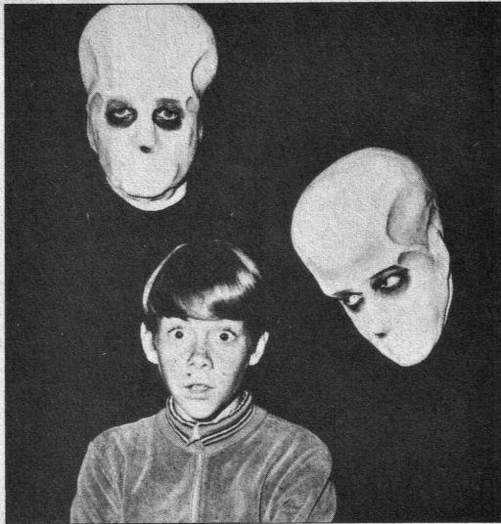
"Invaders from the 5th Dimension," Year One. After Will's brain.

On their way to cap a threatening volcano, Don and Smith are captured by primitives who are governed by a com-