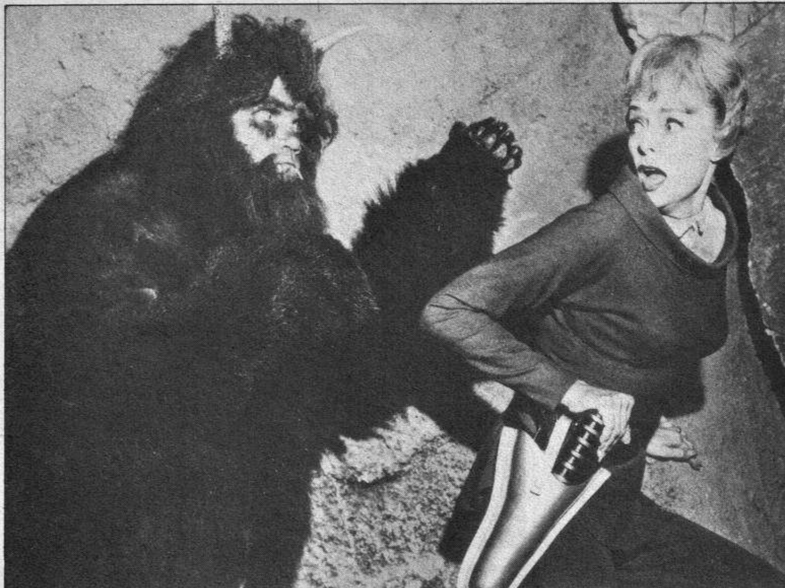
"One of Our Dogs Is Missing," Year One. One of the better scripts that didn't showcase Smith.