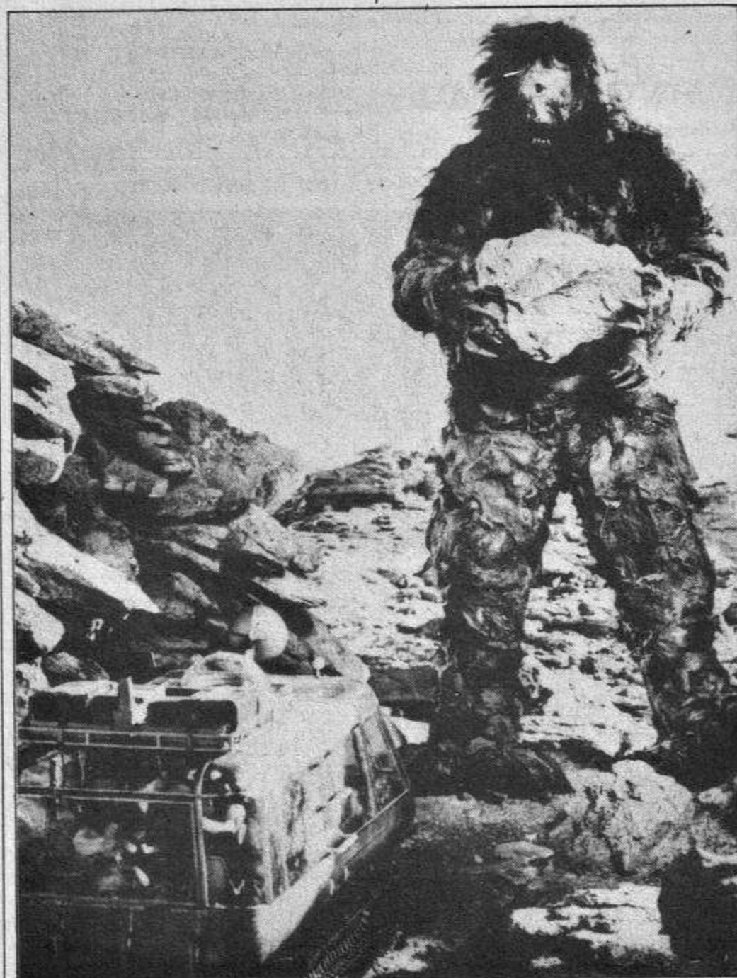
"There Were Giants in the Earth," Year One Solid adventure.