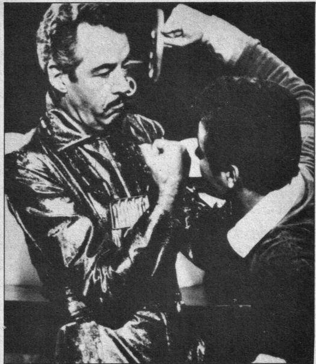
"A visit to Hades," Year Two. Smith escapes the jaws of hell.

Guest Cast: Michael Ansara (Ruler), Kurt Russell (Quano)