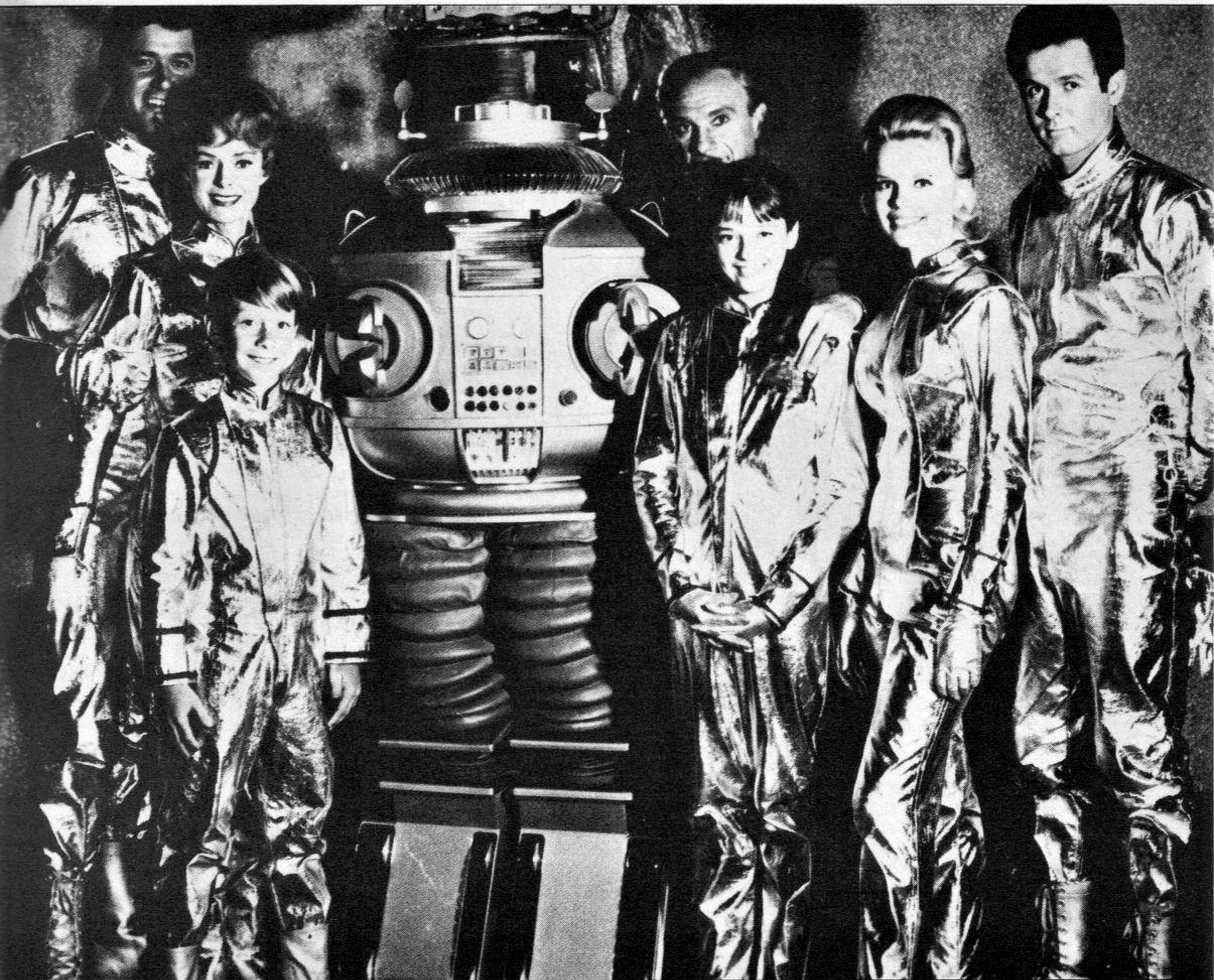
Left-to-right: Guy Williams, June Lockhart, Bill Mumy, Robot, Jonathan Harris, Angela Cartwright, Marta Kristen and Mark Goddard.

doubles, and hijack Jupiter 2 . Will and Smith escape imprisonment, club their impostors, and board Jupiter 2 with the aliens for a flight to Earth.