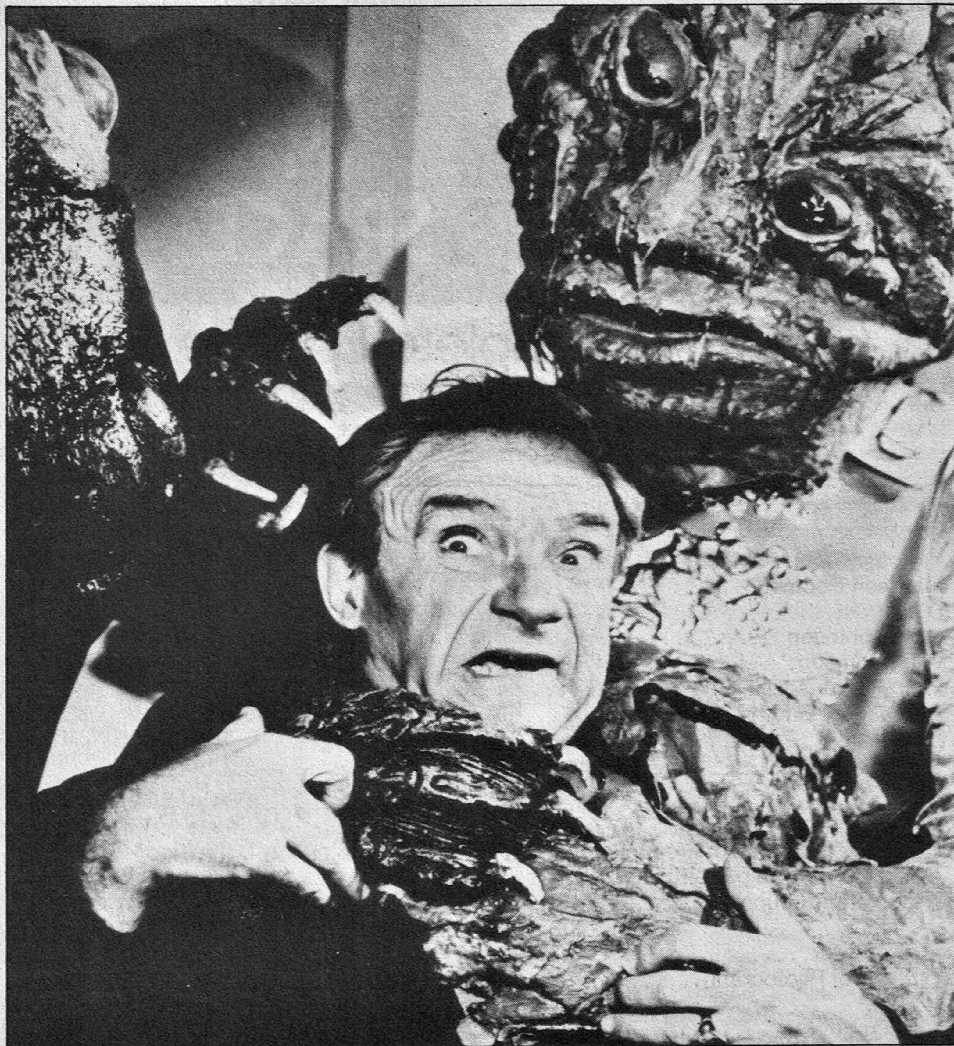
From the Year Two episode, "The Golden Man." Smith learns that beauty is only skin deep.

The Robinsons help repair the ship of another lost traveler from Earth. Since