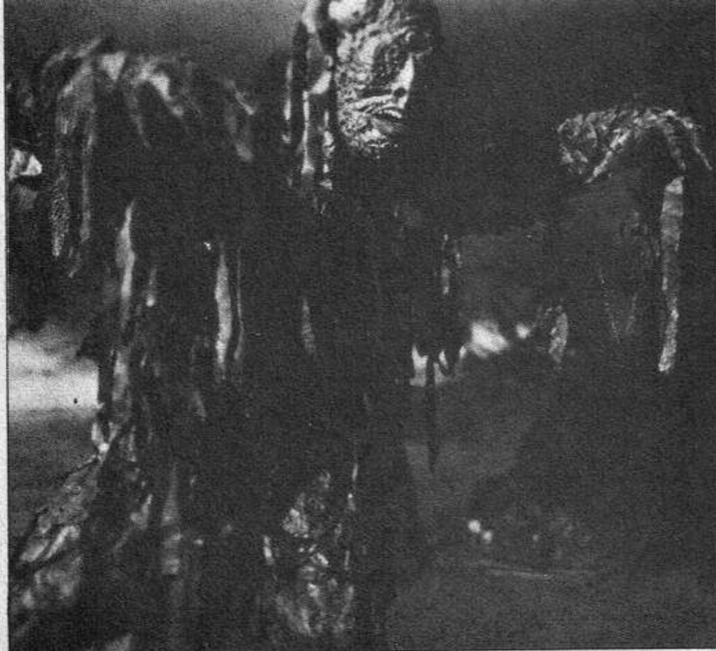
"Ghost in Space," Year One. Bog Monster or Uncle Thaddeus?

An outer-space court accuses the Robinsons of various crimes in space, but after questioning it becomes apparent that