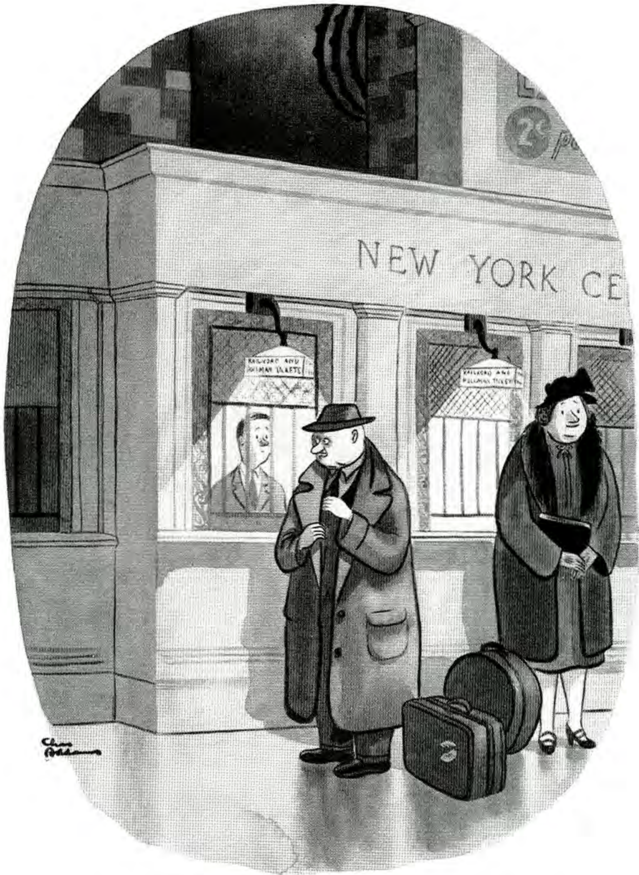
"A round trip and a one-way to Ausable Chasm."