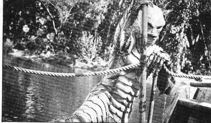
Creature From The Black Lagoon