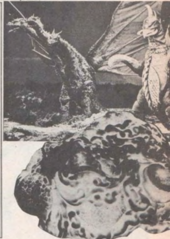
Top right: The two monsters pictured appear in Japan's War of the Monsters (1977). Summoned from "Space M" by two intelligent cockroaches (!) the creatures are defeated by Godzilla and Angirus . Above right: The alien from Jack Arnold's The Space Children resembles a giant brain. Its mission on Earth: to prevent the launching of an atomic missile by the American Authorities.