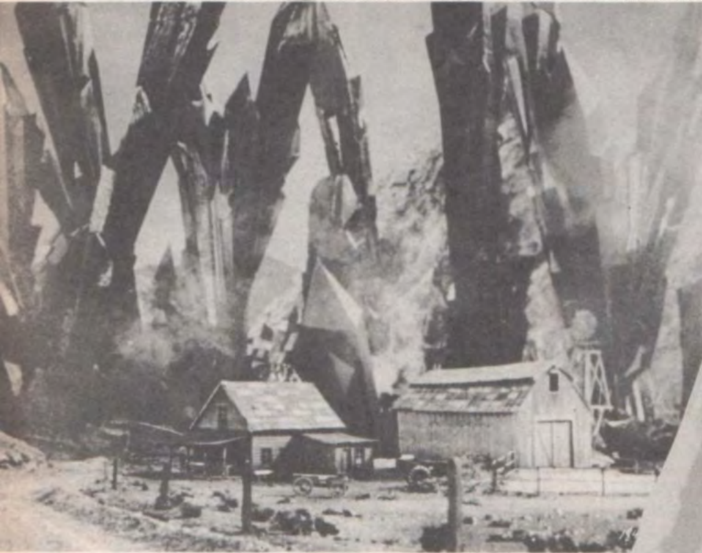
Above: The Monolith Monsters are crystalline meteors which, when wet, absorb the silicon from living creatures, turning them to stone. A cloudburst causes the alien rocks to advance towards a town, increasing in size as they go. Finally their progress is halted by salt. Jack Arnold and director John Sherwood pleaded guilty as charged (1957).