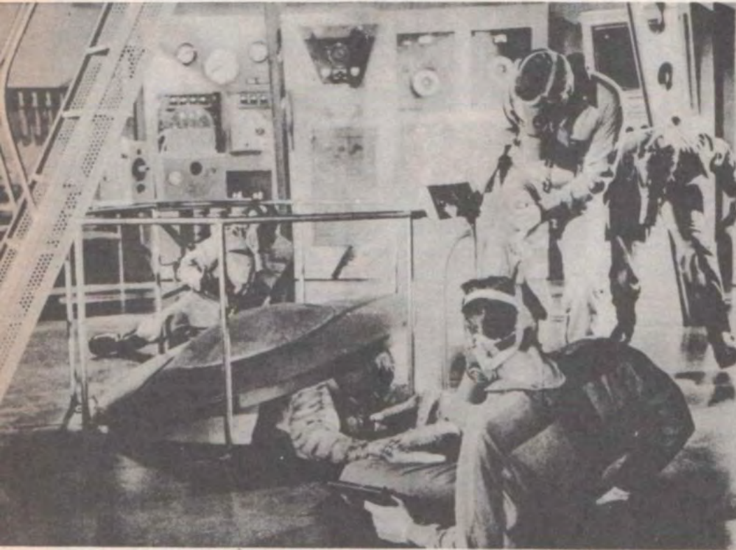
Above: Terror in space! Or more precisely It, The Terror from Beyond Space (1958). The movie (from which Alien lifted liberally) featured Ray "Crash" Corrigan in a snarling rubber suit. The crew of the invaded ship finally suited up and pulled the plug on the oxygen supply, making short work of poor old Crash. Right: Rock star David Bowie as he appeared in The Man Who Fell to Earth. (1975).