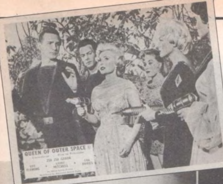
Left: The Queen of Outer Space (1958) featured Zsa Zsa Gabor and concerned the ruler of Venus, a despotic, hideously scarred matriarch who wants to conquer Earth.