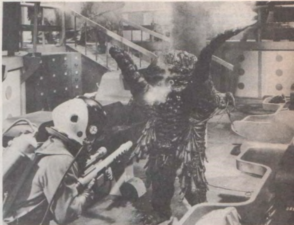
Above: The Green Slime (1968) was an American/Japanese co-production in which grotesque alien lumps invaded a space station and began to multiply at a furious rate. The movie is a strong contender for the Worst SF Film of All Time award. Below left: In the 1967 Roger Vadim movie Barbarella , Jane Fonda (in the title role) met an alien angel played by John Philip Law.