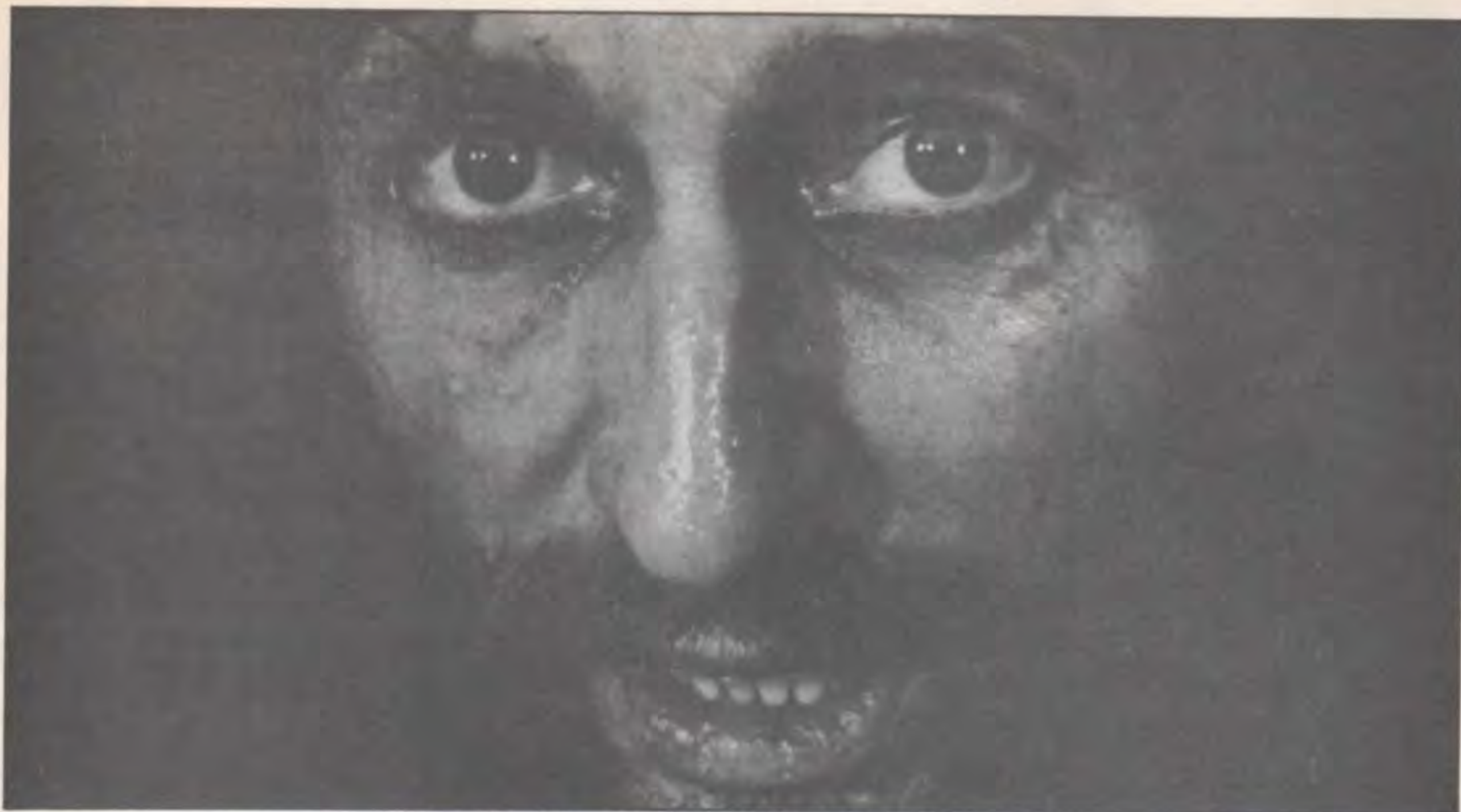
Above: Tom Baker, as Rasputin, in Nicholas and Alexandra (1971).

drama school. But he had to wait seven months before the course started, so he joined the Merchant Navy as a seaman on the Queen Mary , then came back for the drama course which lasted two years. He found work in repertory theatres around Britain and it was during this time that he discovered a dog's life has its advantages.