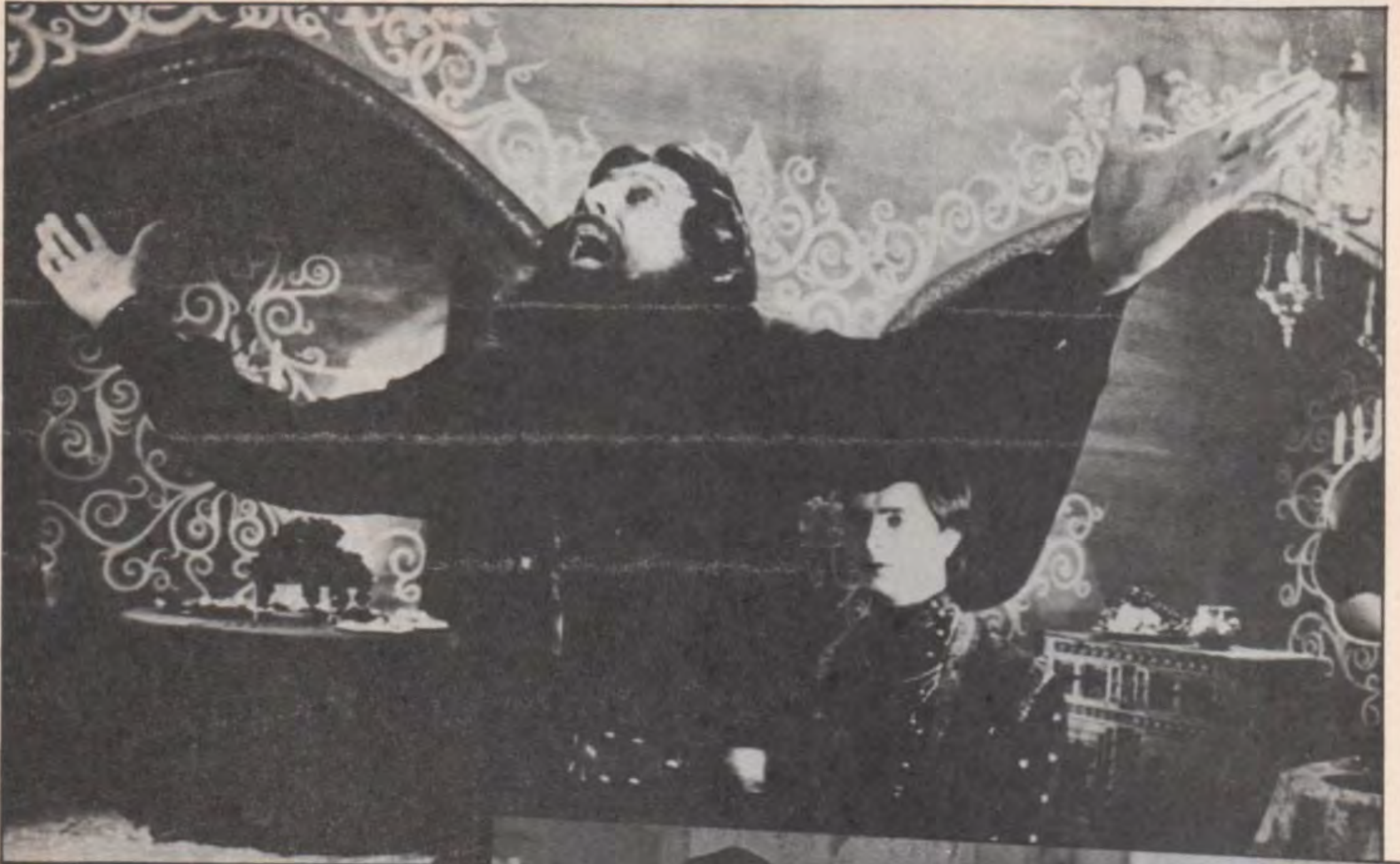
Above: Tom Baker, as Rasputin, in Nicholas and Alexandra (1971). Right: Baker sits in the makeup chair for the same film. Opposite: Baker as Prince Koura in The Golden Voyage of Sinbad (1973).