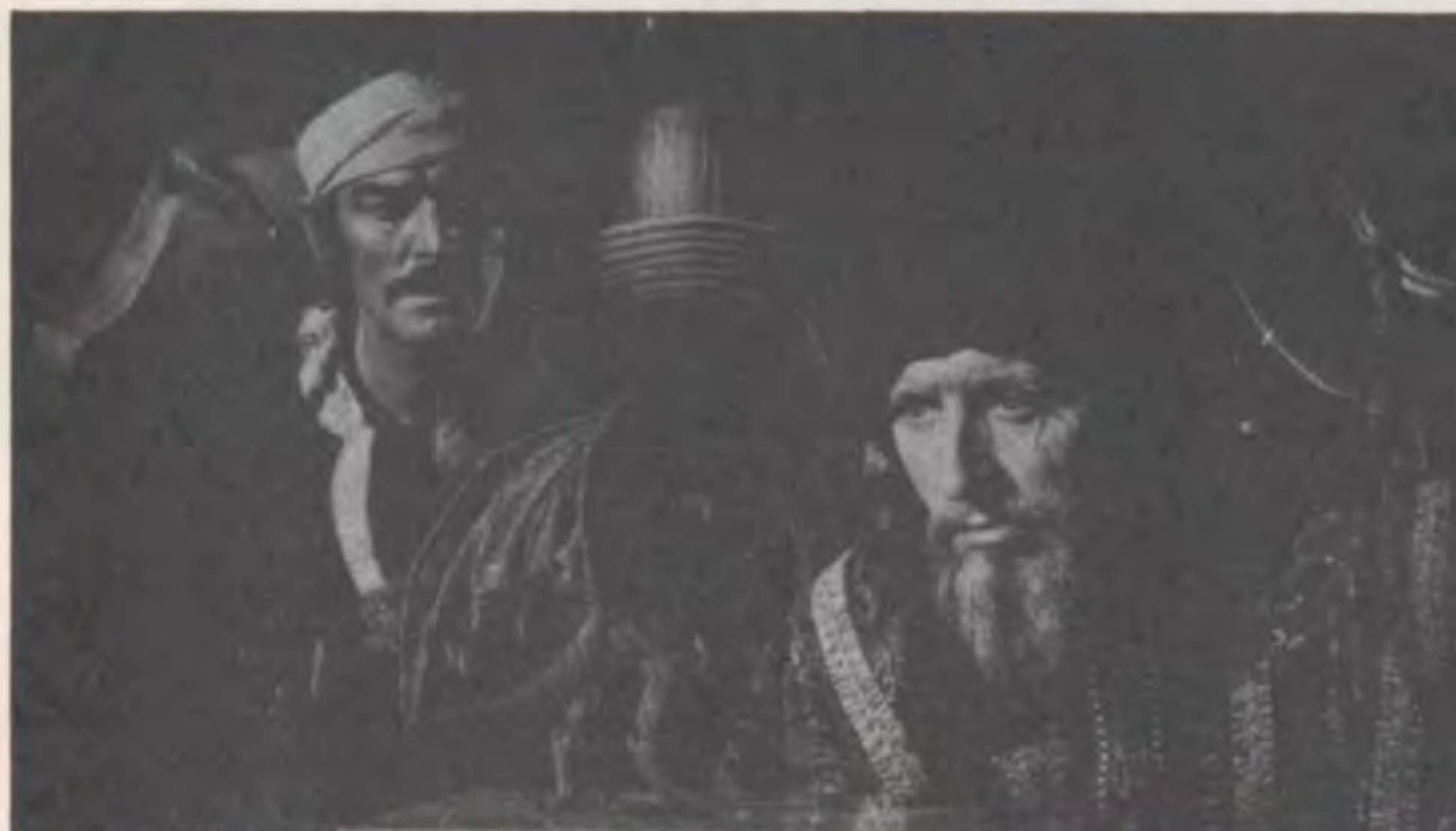
Top: Tom Baker as the villainous Prince Koura with the beautiful Caroline Munro (as the slave-girl Marigiana) in The Golden Voyage of Sinbad (1973). Above: Koura listens to a report from his magically created Homunculus.

T he Times once wrote of Tom Baker that he was "a very tall man with a beautiful voice and a range of expression from the nobly heroic to a fleeting resemblance to Harpo Marx". And that's all most people know about one of British television's most successful and popular actors. A superficial image of a tall, loquacious man with a long scarf. But what is he really like? How did he become one of the screen's most instantly recognisable faces?