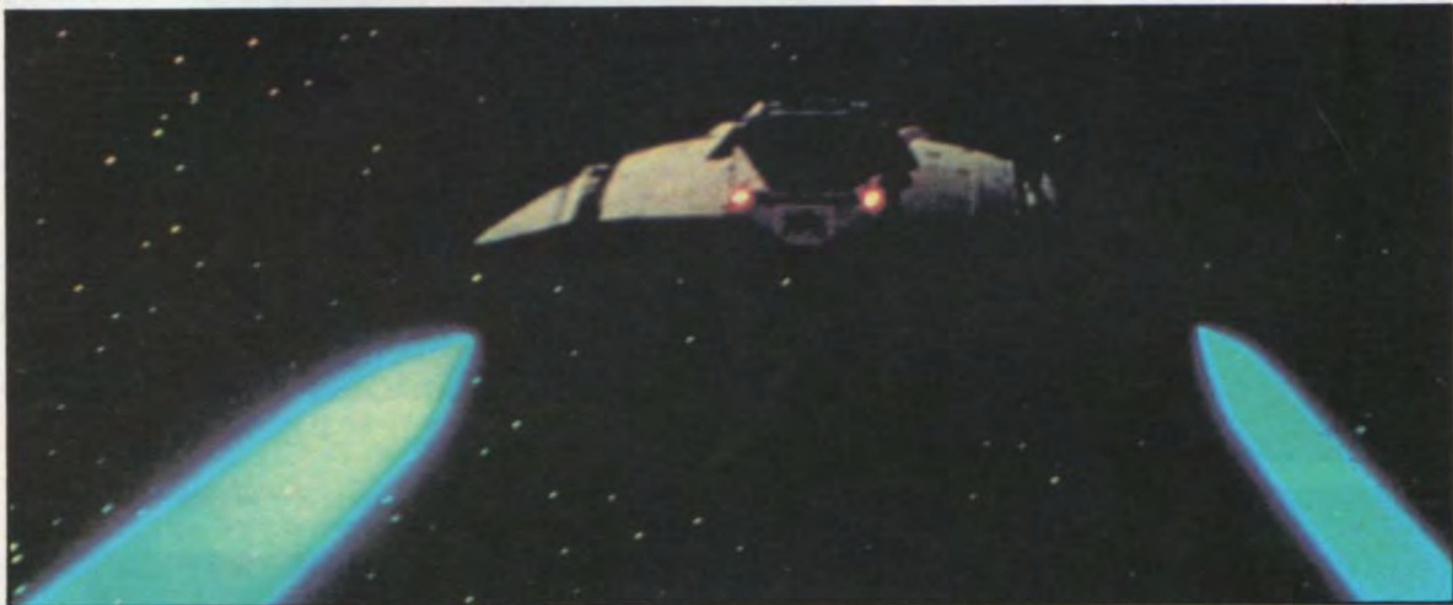
Above: a Cylon fighter in a destructive mood, looking somewhat similar in design to George Pal's Martian war machines.

By way of a special preview to the much-publicised Battlestar Galactica , we present a pictorial feature revealing the ingenuity of the special effects. The "pilot" will be shown in this country as a theatrical release and will then become a tv series debuting in the summer of 1979.