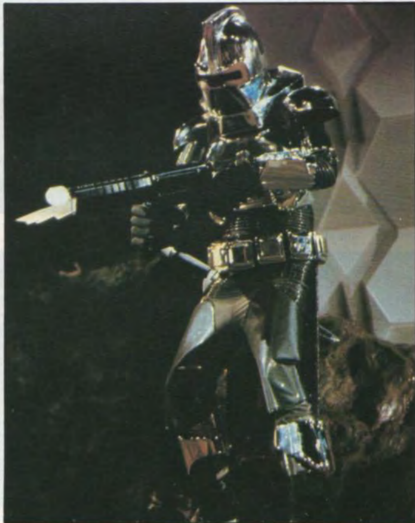
Fanatically intent on destroying all humans, the dreaded Cylons appear as steel-clad, robotic dealers of destruction.