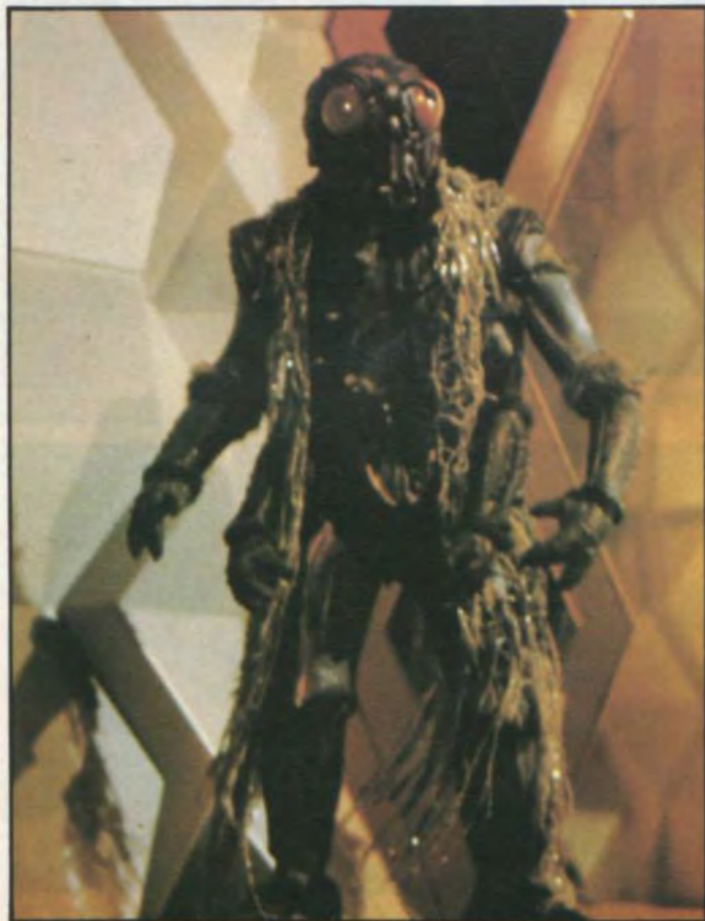
The Ovions, a race of insect-like aliens, lull the fleeing humans into a state of false security, actually preparing them for death.