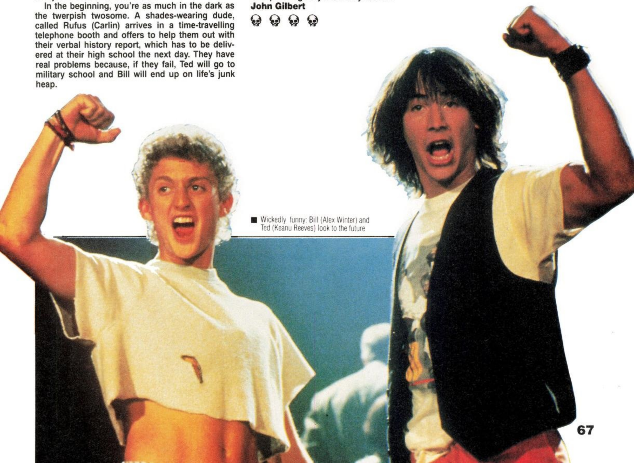
■ Wickedly funny: Bill (Alex Winter) and Ted (Keanu Reeves) look to the future