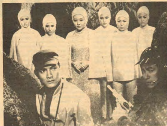
Earth scientists and Moonlight crew members are trapped by an attractive team of cunning Kilaaks who, protected by their electronic invisible shield, once again assure the Earthmen of the folly of their resistance to Kilaak conquest of the much-maligned planet. But we're not about to give up so easily—that, among other things, is what makes this planet great.

"And until we do, you're going to let the monsters run around free. That's all this