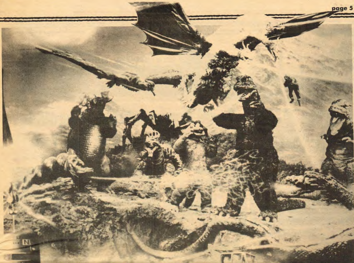
Brought to their senses by the destruction of the alien control center, an awesome army of homegrown monsters rallies to the Earth's defense. Here we see, from left to right, Mothra, Baragon, Rodan, Speiga, Angilas, Minya, the Big G., Varan, Gorosaurus, and Manda gang up on Ghidrah, the aliens' 3-headed ally.