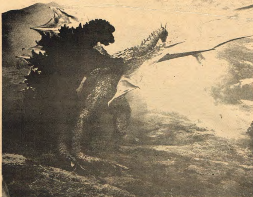
The Big G. is forced to lean a little on Ghidrah, giving the beaten monster a final shove that will send him on his way back into outer space, his tail between his legs and all three heads hung in shame. Once again our puny but gutsy planet has been saved from the clutches of alien domination. You can bet it won't be long, though, before other aliens will be taking us on again...

one of his three necks...he succeeds, and digs his teeth into Ghidrah's flesh. Ghidrah takes to the air with Angilas still hanging on by his teeth and drops him on the other monsters.