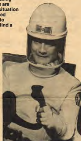
The crew of Moonlight SY3, under the direction of the heroic Tatsuuo, blasts off into space on what begins as a routine mission, but soon the fate of the entire world will be in their white-gloved hands.

Suddenly all communication is cut from Monster Land. In Tokyo, the United