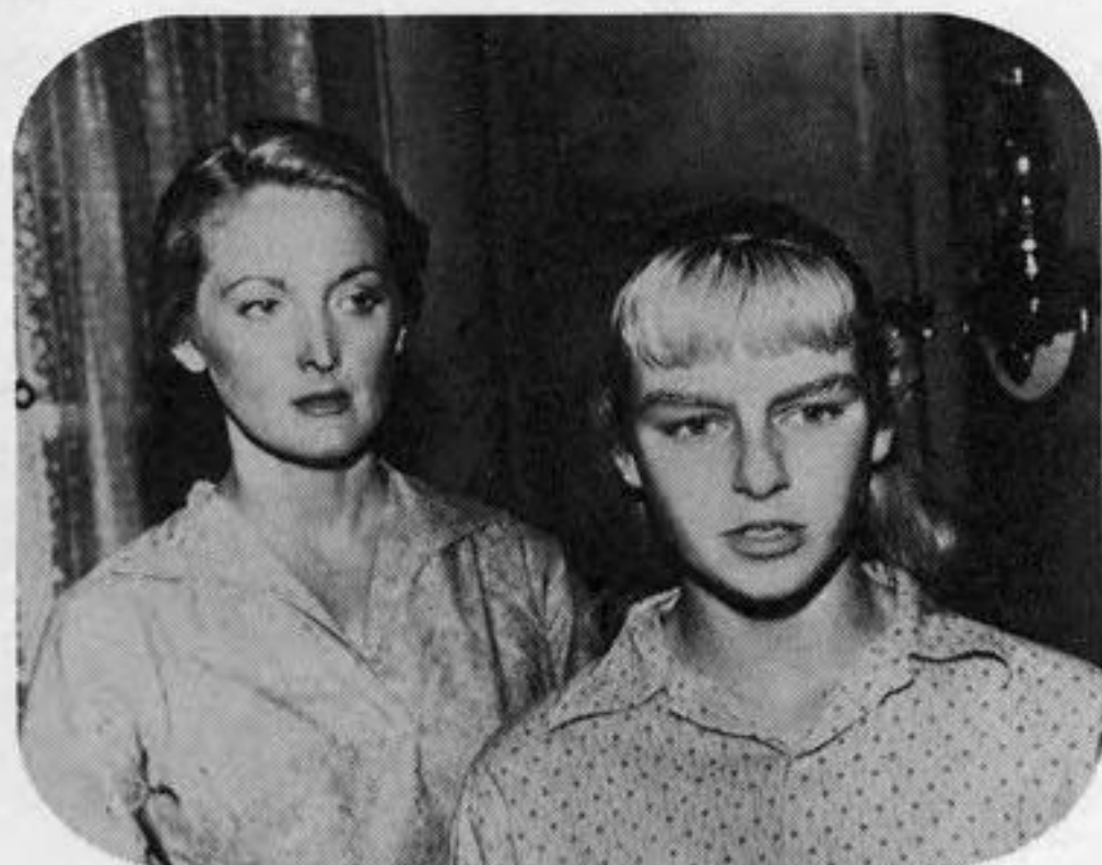
"Make Me Not A Witch"