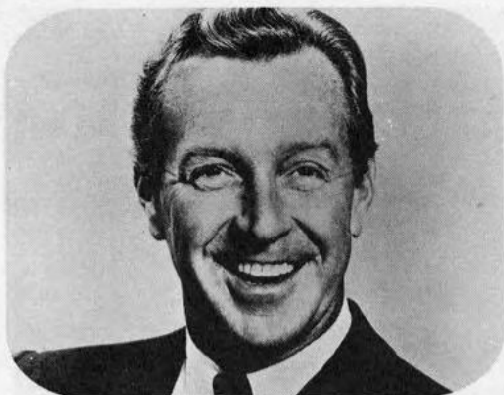
Host John Newland