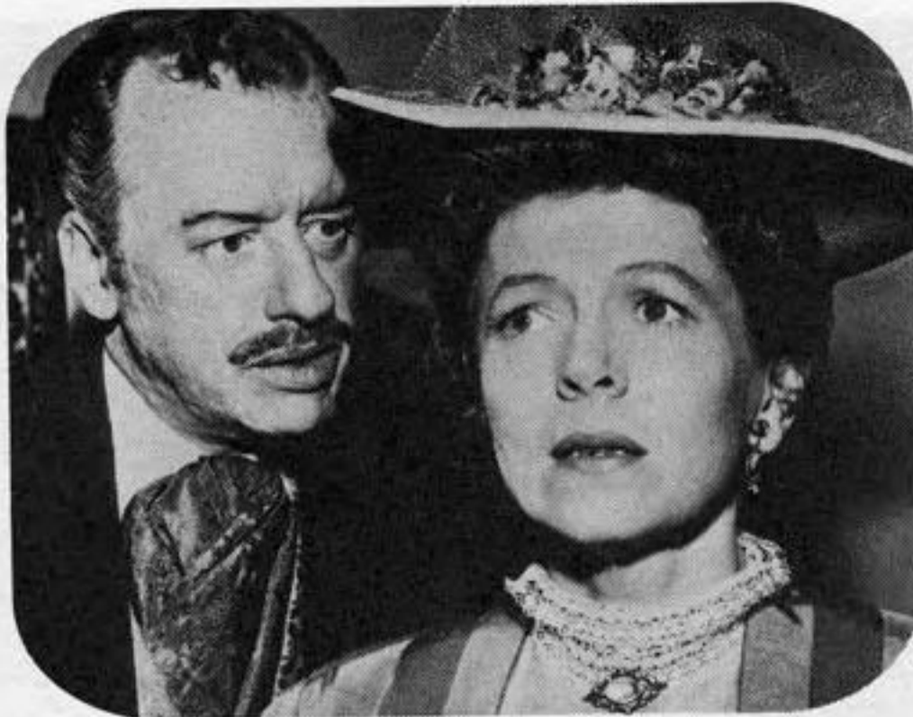
"Ordeal on Locust Street"