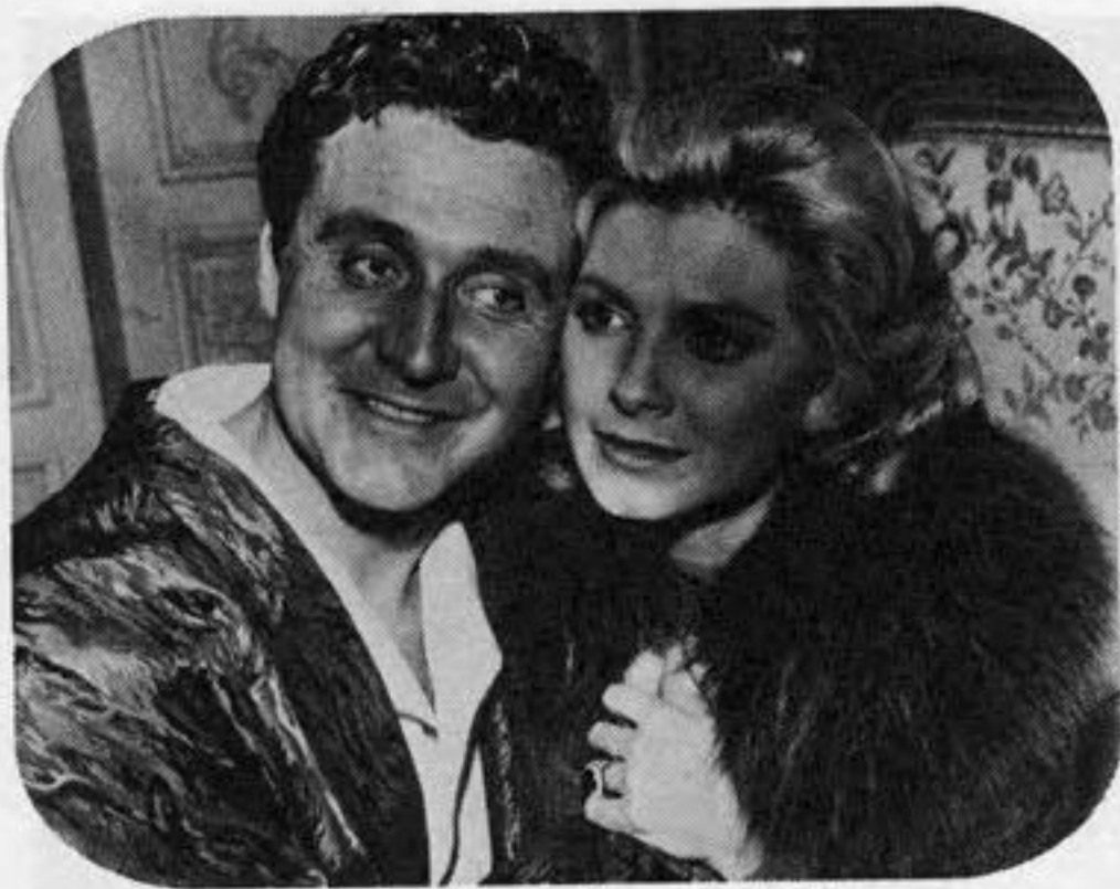
"Night of April 14"