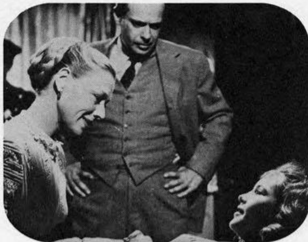
"Who Are You"