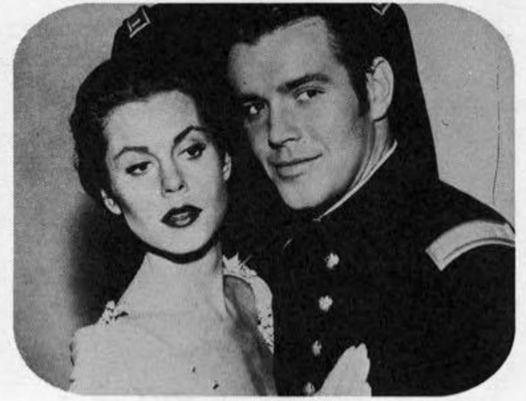
"The Death Waltz"