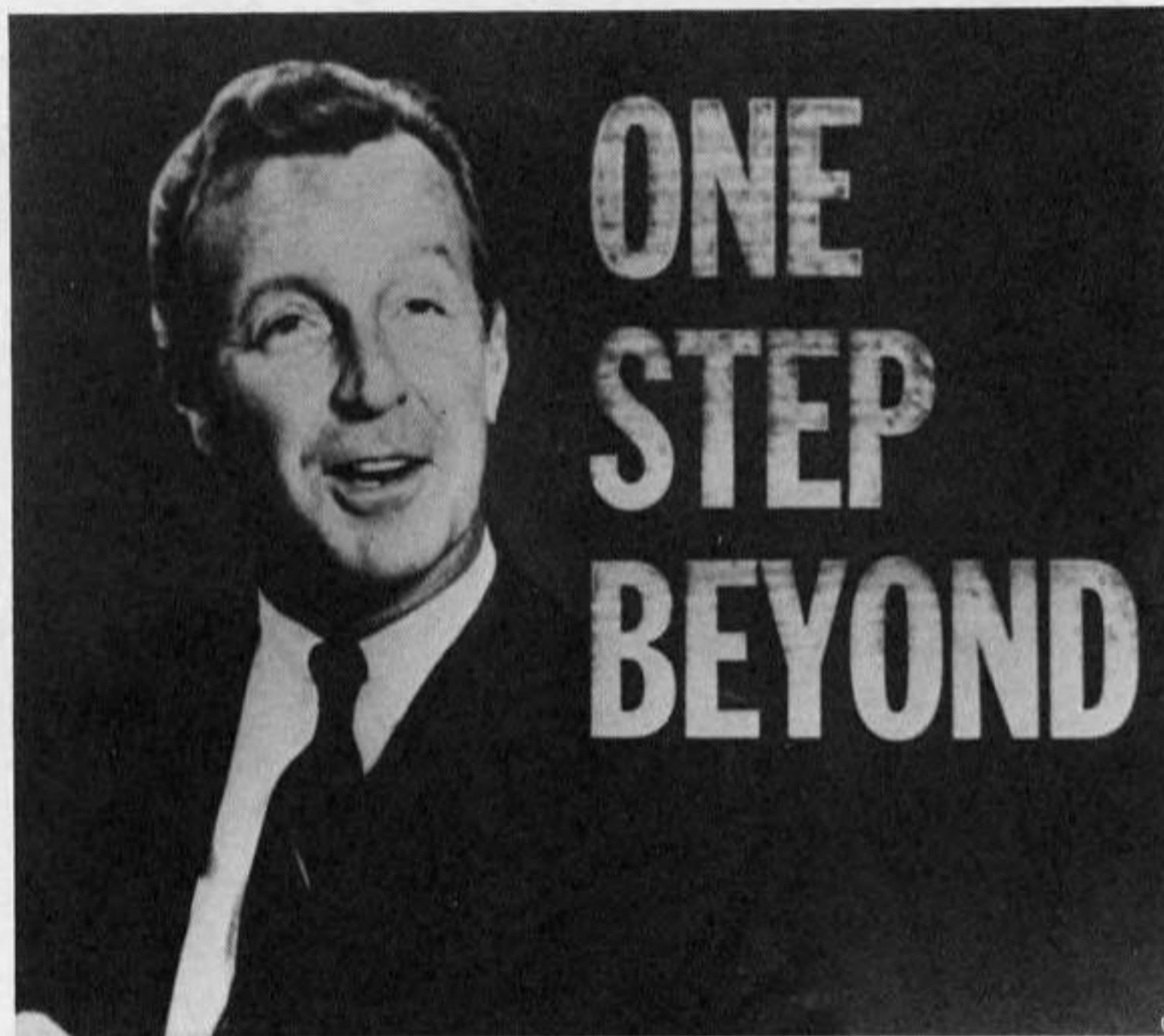
ABOVE: John Newland who appeared each week as host, also acted in and directed the series. OPPOSITE: Cloris Leachman, in an early TV appearance, had her back against the wall in "The Dark Room."