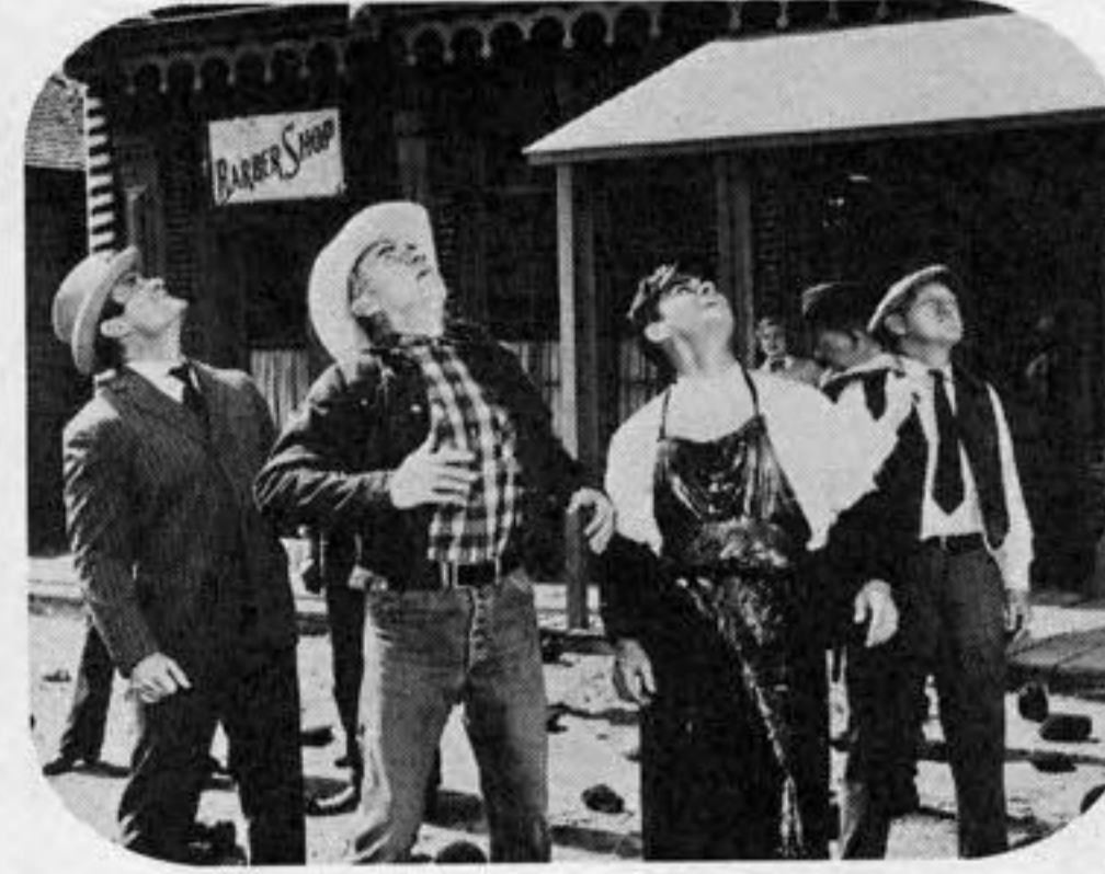
"Where Are They?"

An aging boxer has a vision of his dead colleague, whose presence reputedly foretells another death in the ring.