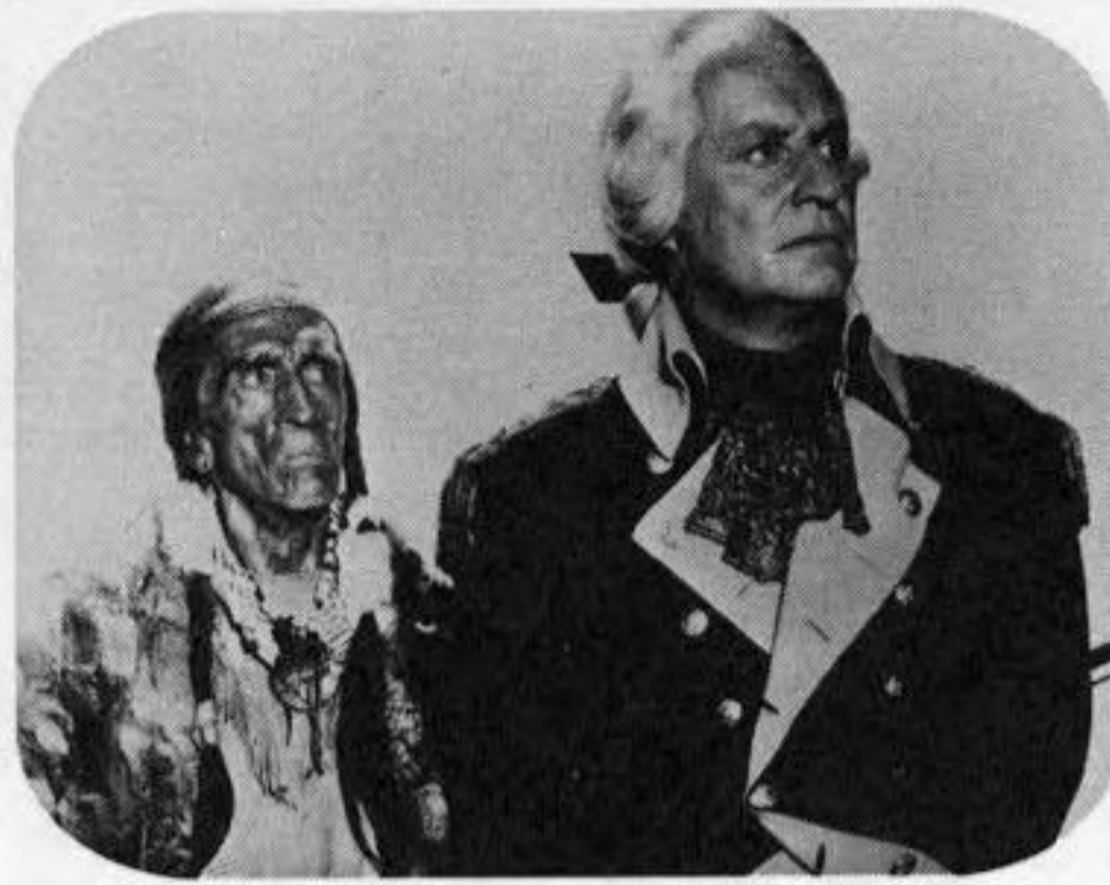
"Night of Decision"