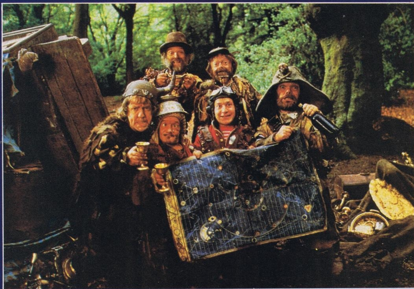
The six dwarves pose for a family portrait with their stolen map of the universe (which indicates all of the holes in time). In no particular order, the six are: Randall, Fidget, Wally, Og, Strutter and Vermin. The picture was snapped on Kevin's Polaroid.