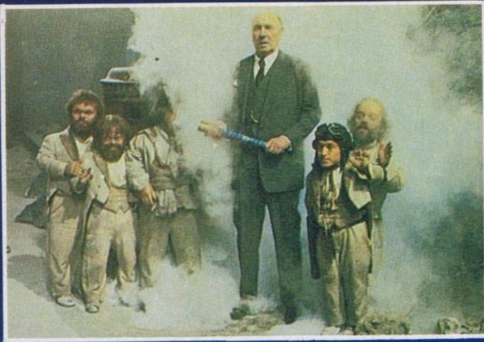
Above: The Supreme Being incarnates as Ralph Richardson, just in the nick of time to save the dwarves from the clutches of Evil.