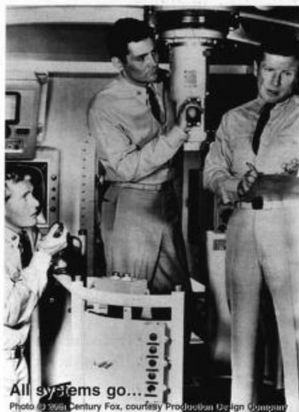
All systems go...

Premier Brynov, leader of the hostile Peoples Republic, is supposed to have resigned, but actually faces a firing squad.