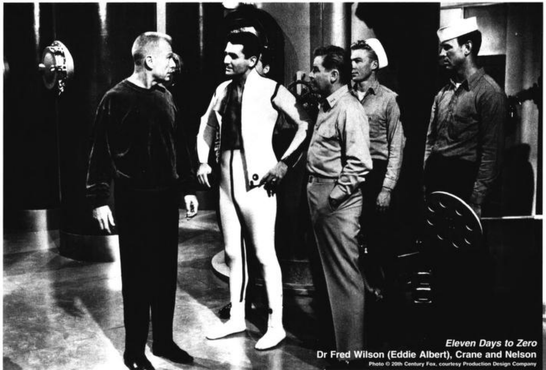
Eleven Days to Zero Dr Fred Wilson (Eddie Albert), Crane and Nelson

As Admiral Nelson and Seaview Captain John Phillips drive urgently to a top level meeting, they are attacked by enemy agents. Phillips and the motorcycle escort are killed, but Nelson survives to make the conference and press home his theory that only a controlled nuclear explosion at the polar icecap can prevent a massive earthquake sending huge tidal waves sweeping down the Atlantic and Pacific coastlines in eleven days, decimating half the planet. With his plan reluctantly approved, Nelson takes aboard specialist Dr Fred Wilson and a new Seaview captain, the young but highly-rated Lee Crane, on loan from the Navy. But the trip to the Arctic Circle is not without its hazards, and the submarine is depth charged and bombed from the air, as the destruction of the 'free world' would be welcomed by a hostile foreign power.