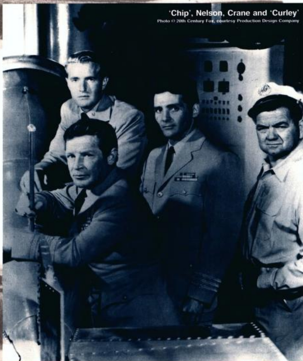
'Chip', Nelson, Crane and 'Curley'