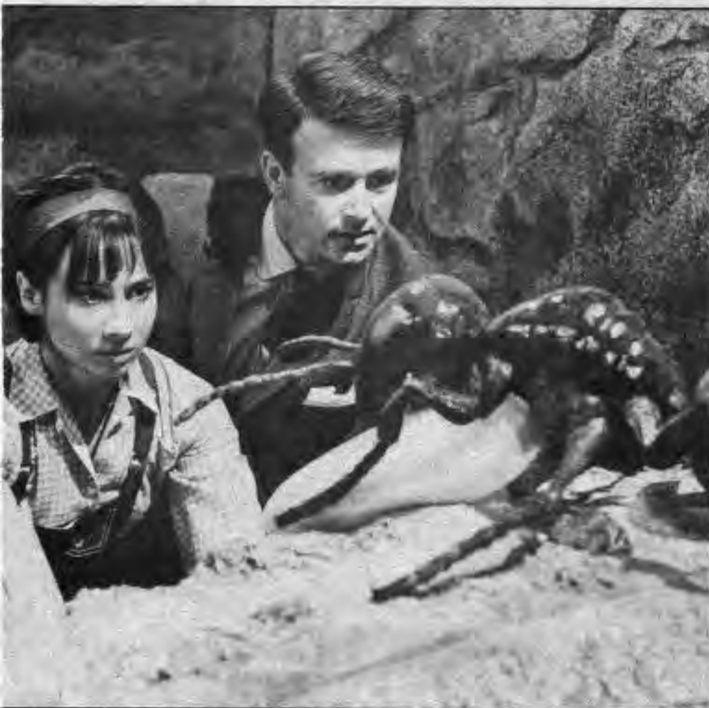
Sci-fi Fiction episode, "The Planet of Giants," has Dr. Who & his friends time-travel to a world where they are only 1" in height and in danger of being washed down plug holes and tumbling into match-boxes.

WHO & THE DALEKS and INVASION EARTH 2150 AD)... and the sad story behind the Daleks was almost forgotten. They were the result of a terrible neutron war on their native planet, Skaro. They had once been quite different, perhaps even beautiful. The neutron war released radioactivity which made the Daleks mutate & change. First they lost the use of their arms & legs. Then, their bodies became useless—until only their brains were left. So they built these traveling machines. The Dalek, you see, is not a real being. It is only a container for the brain of a being which no longer has a body. Even their voice isn't their own; it is an electronic voice, a loudspeaker inside the container which says what the brain wants it to say. Perhaps these are the reasons they are always so unfeeling, cruel & violent: they hate every living thing which still has its own body. Above all they hate the Doctor because he has defeated them so many times.