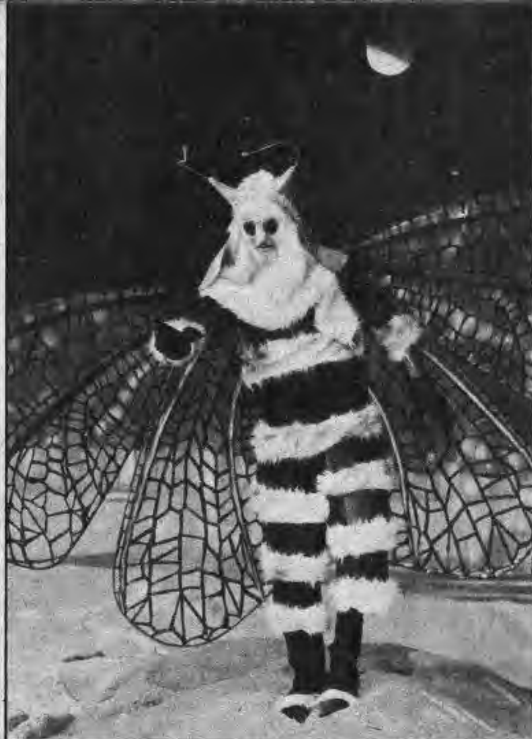
Insectoid warmakers infest the planet Vortis. These Zarbis capture Dr. Who, in "The Web Planet!"

Time & again the Master, a totally evil genius, struggles against the Doctor. The Master too is a runaway Time Lord. He stole a TARDIS and has roamed all over the Universe. But except for that, the Doctor & the Master are totally different. The Doctor left his fellow Time Lords because they bored him and because he had a great