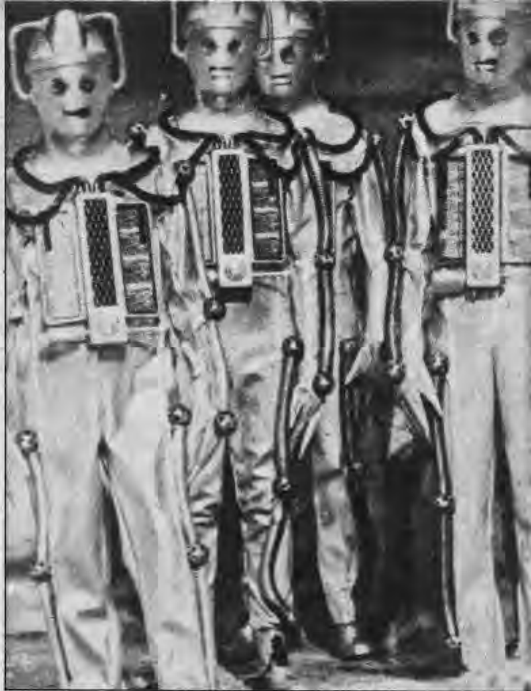
The dreaded Cybermen, looking warmly enough dressed for a trip to Siberia.

The man in charge of Britain's branch of UNIT is Brigadier Alastair Lethbridge Stewart (Nicholas Courtney), an Army man who goes by the book. So he & the Doctor do not always see eye-to-eye. For instance, when the Silurians, a nest of human-like reptiles hibernating in deep cav-