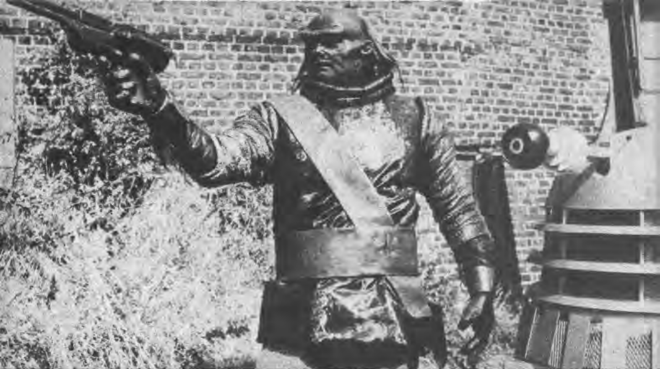
An Ogron, one of a race of cruel & primitive aliens, used by the Daleks as guard dogs.

A suspicious DR. WHO discovers the Axons, their ship & a material called Axonite are all part of a parasite brought by the Master to absorb all living energy on Earth!