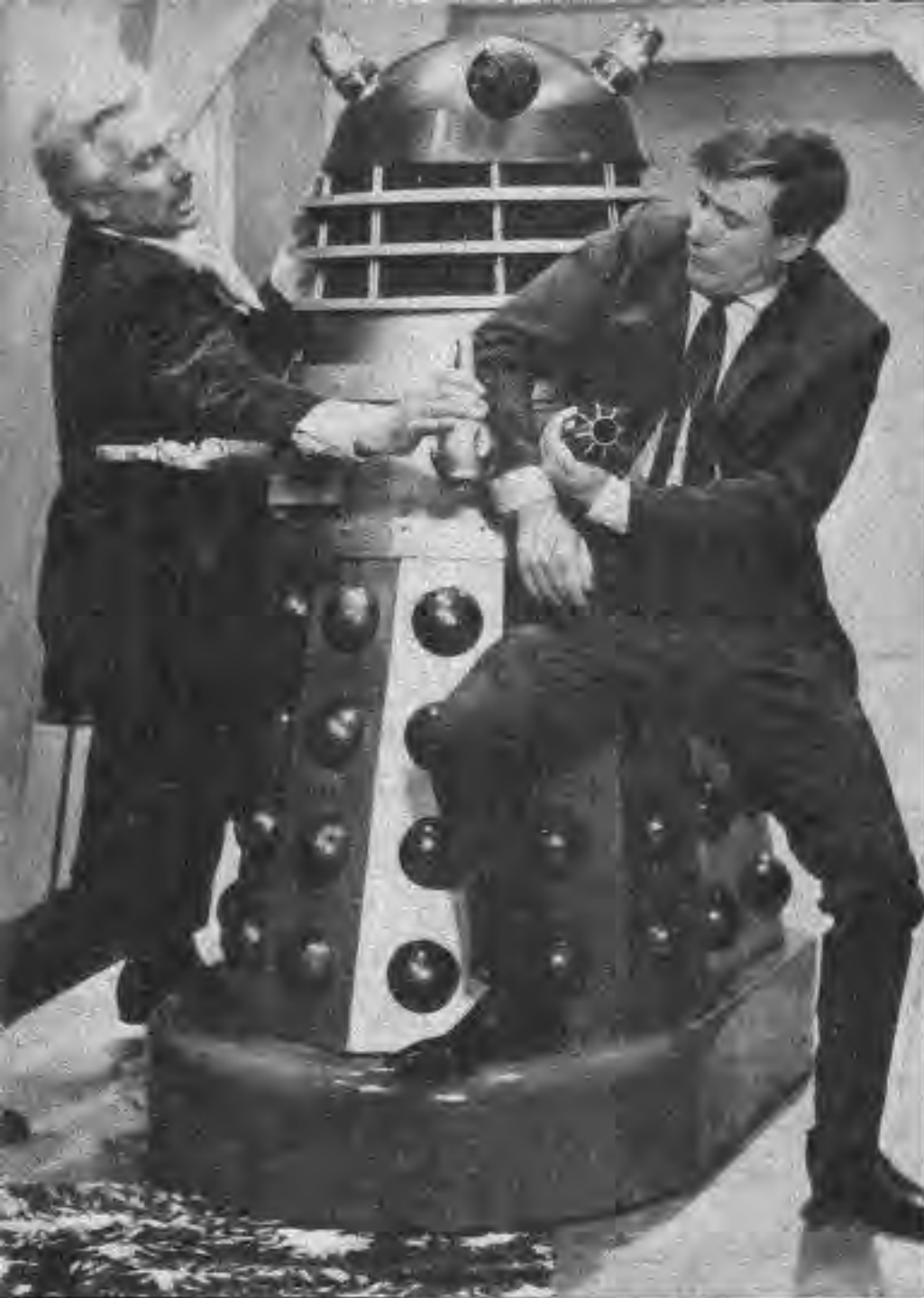
Peter Cushing vs. The Daleks. For more on this movie version, see coverage in FM 124.

erns for millions of years, were brought back to life by accidental electrical discharges from a nearby research station, the Doctor investigated the caves and communicated with these creatures. They claimed that Earth had been theirs before people populated it; to put it bluntly, they wanted their planet back. To destroy Humanity they released a terrible disease. Many people were killed. The Doctor found the antidote but then took it upon himself to discuss peace terms with these monstrous murderers! He thought both humans & Silurians could live together in harmony. Brigadier Stewart took "normal military action" and, using explosive charges in the caves, totally destroyed the enemy. Instead of thanking him, Dr. Who was displeased. Humanity had annihilated an intelligent lifeform, probably the last of their species, and the Doctor had a reverence for all living things!