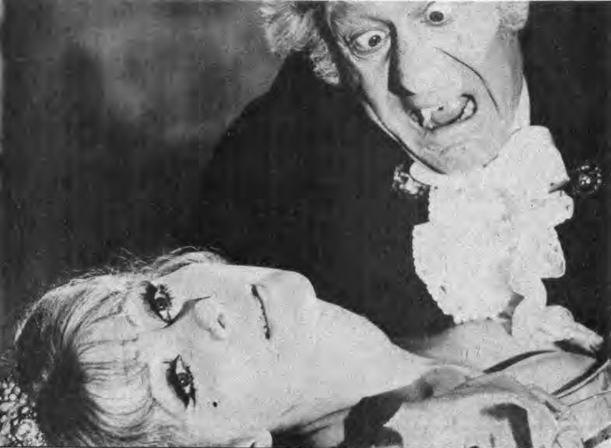
Dr. Who meets Who? Ingrid Pitt, that's who. Jon Pertwee as the star of the DR. WHO series, playing part of vampire thirsting for Ingrid's throat in THE HOUSE THAT DRIPPED BLOOD.

or a mechanical hand. But now the moment has come in the story when the monster will be revealed. Here it comes, lurching from the shadows, eyes flashing, ray-gun blazing, advancing toward the daring Doctor & his terrified companions! However, what you don't see is the man from the BBC's Visual Effects department who is trailing behind the monster, turning off & on those flashing eyes. Nor do you see the perspiring actor who is inside the heavy costume of this terrifying alien invader from Space... most of the monsters & aliens in DR. WHO are actors inside specially-designed costumes.