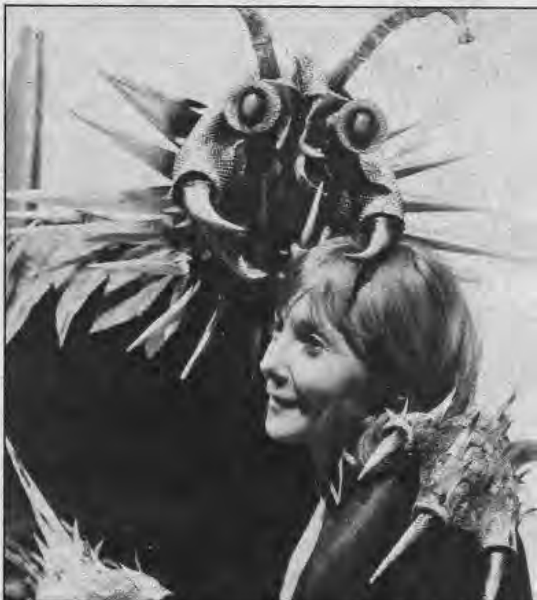
Koquillion protects Maureen O'Brien from kill-crazy aliens on the planet Dido in the year 2493. Dr. Who has an amazing adventure on the weird world in the episode known as "The Powerful Enemy."