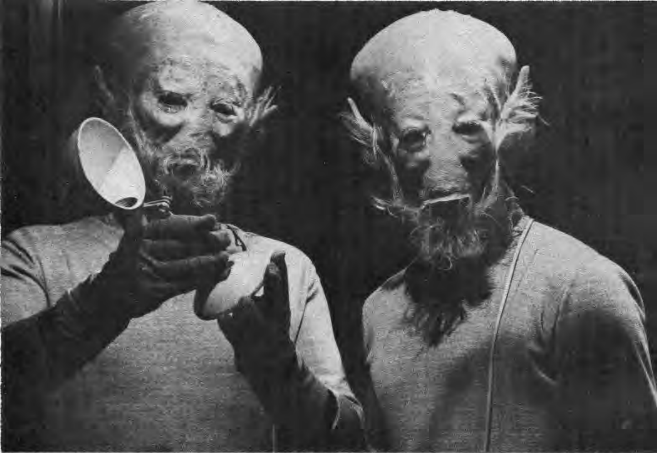
The Sensorites! Fearsome creatures who cannot stand noise or darkness. At first hostile, they become friendly when Dr. Who discovers a cure for the mysterious disease that is killing them.