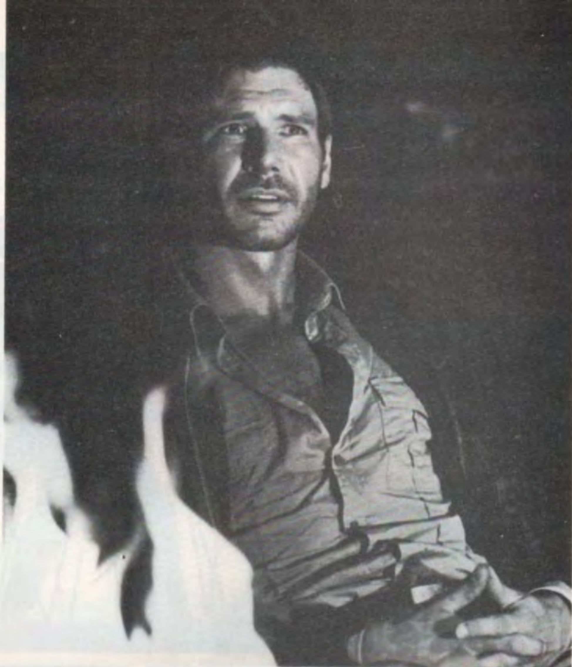
Above: Harrison Ford stars as the daredevil archeologist, looking as astonished as ever, in Indiana Jones and the Temple of Doom . Top right: Sporting the remnants of a shirt, Indy crosses a rickety rope bridge on his quest for the Temple of Doom . Far top right: A quick change of clothes transforms Indy into Dr Jones, Professor of Archeology, but he is still in need of a shave. Far right: Accompanied by nightclub singer Willie Scott and a cute Chinese kid called Short Round, Indy makes his way through an Indian village. Below right: The rugged features of Indiana Jones . Below: A romantic interlude between Indy and Willie Scott (played by the captivating Kate Capshaw).