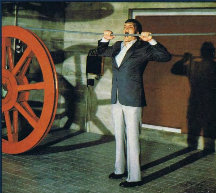
Richard Kiel, as Jaws, prepares to do in Bond in Moonraker .

Eerily elegant Dr. No; scheming and slithering Blofeld (at least he loves his cat); Largo—the wealthiest pirate of the Caribbean; the fearsome servants of SMERSH—Kronstein, Grant and Klebb; brilliant and playful Scaramanga; greedy and crude Goldfinger; Jaws, Drax, Oddjob . . . and the rest—each and all dedicated to domination and conquest, each and all determined to insure the demise of the ever-present and ever-annoying Mr. Bond.