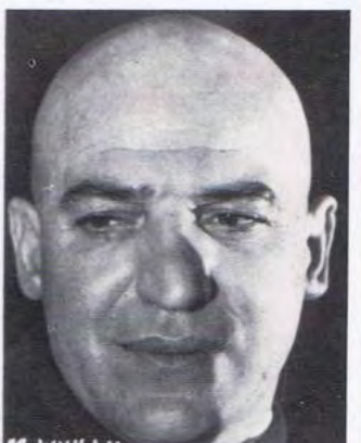
Clockwise from Top Left: Jaws (Richard Kiel), Dr. No (Joseph Wiseman), Ernst Blofeld (Donald Pleasance), "Red" Grant (Robert Shaw), Goldfinger (Gert Frobe), Largo (Adolfo Celi), Blofeld (Telly Savalas), Blofeld (Charles Grey), Dr. Kananga (Yaphet Kotto), Scaramanga (Christopher Lee), Nik-Nak (Herve Villechaize), Stromberg (Curt Jurgens). Center: Rosa Klebb (Lotte Lenya).